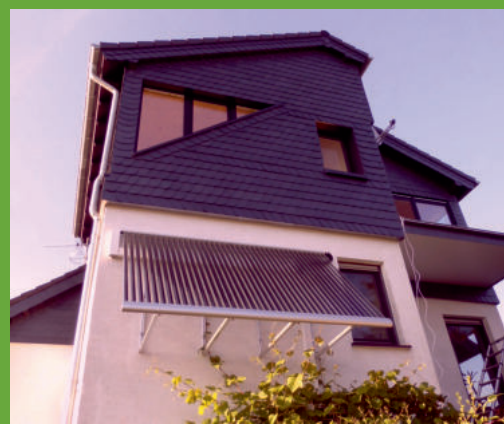
house in Overath, Germany