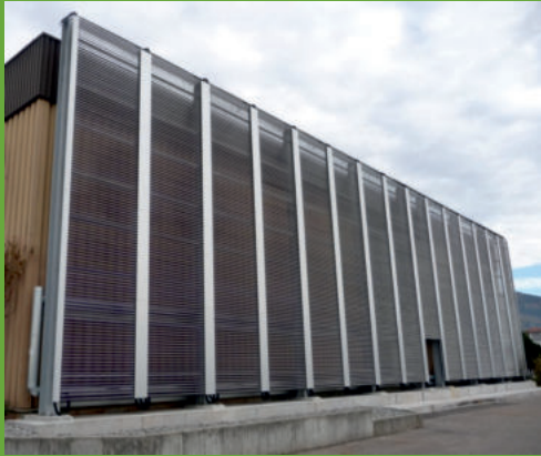
fruit distribution center Oberkirch, Solar process heat for cooling