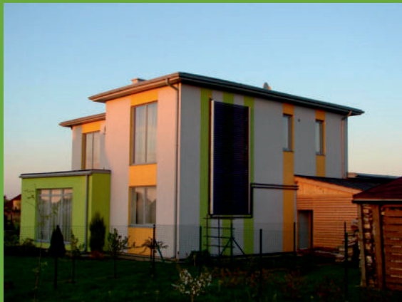
Single family house in Kekava, Latvia, facade installation, 60 direct flow power tubes