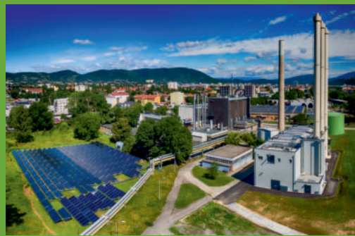
district heating network Graz, MEGA collector