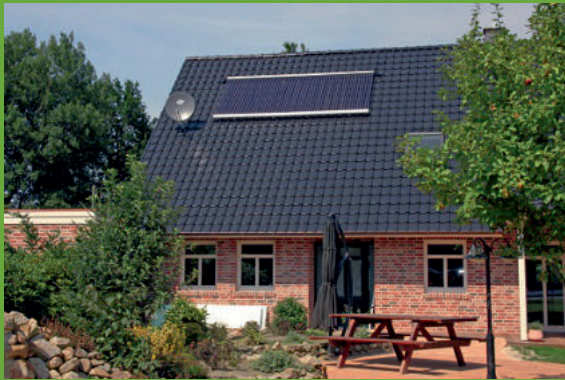
Single-family house in Meppen, Germany, roof assembly, 60 heat pipe tubes,