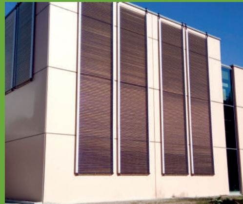
Rothaus brewery, Solar process heat