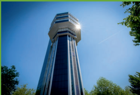
Hotel Aquaturn, Radolfzell, Germany, heating, warm water