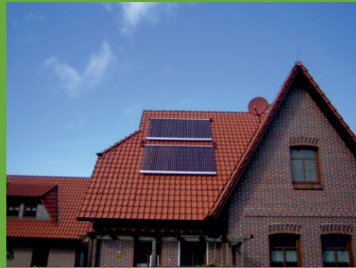
Single-family house in Meppen, Germany, roof assembly, 160 heat pipe tubes,